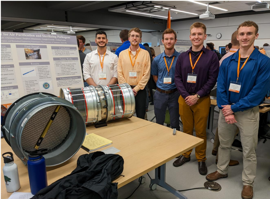
Figure 2 : ME-460 Class of Spring Semester 2022 presenting Air Ionization Project findings for the annual engineering showcase at new Zeanath Building.