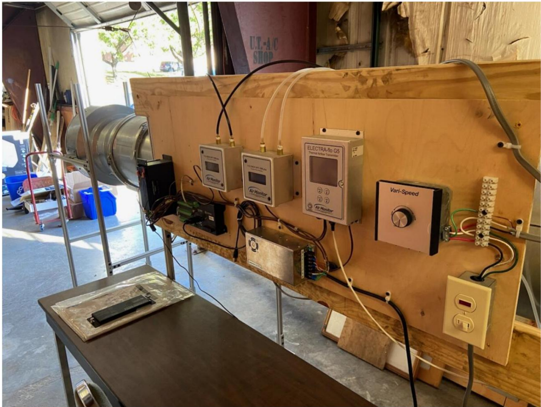
Figure 1 : AITF wind tunnel north view showing instrumentation board , cabling, work table, and flow exhaust to UT Drive Services Building B outdoor exit.