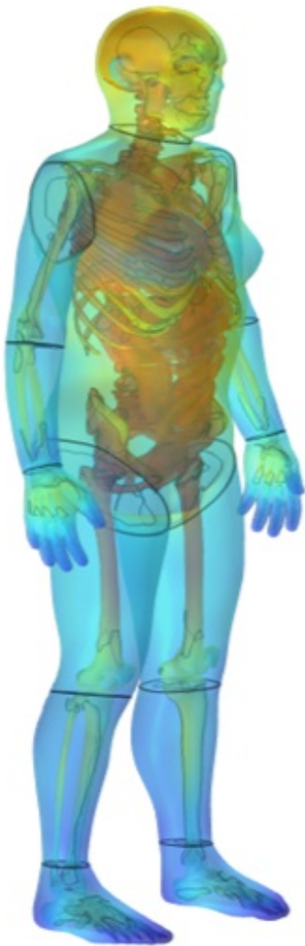
Figure 1 : Figure 1. Steady state temperature distribution of female at ambient temperature 29°C