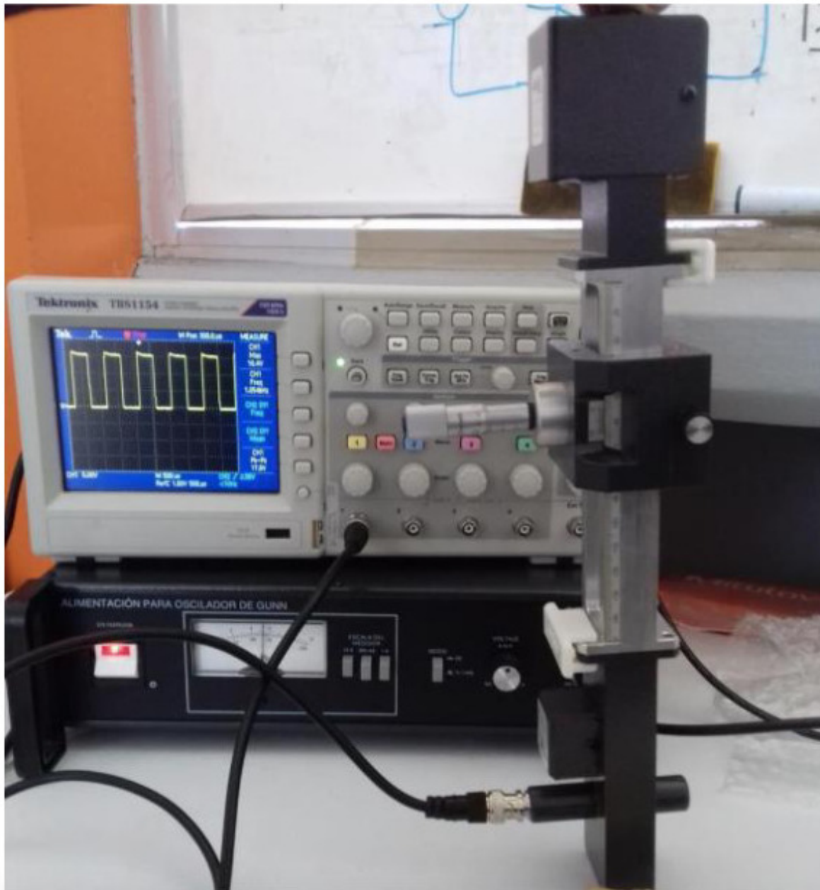
Figure 1 : Figure 1.- Equipment for dielectric characterization by the Von Hippel method